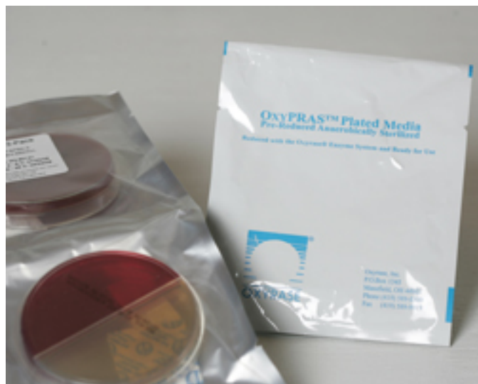
The PRAS difference

than the plates we had been using, we are replacing them with OxyPRAS Plus Brucella plates; including subculturing anaerobic isolates for identification on the Vitek 2 (microbial identification system).”